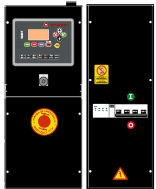
Pictures of Control Panel RH and Controller LH may include optional equipment and/or accessories

Also included in Hipower's supply: Emergency stop button and mainline circuit breaker.