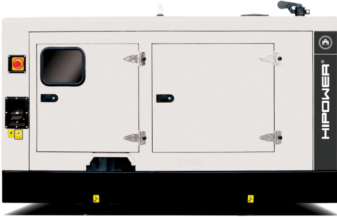
Generator depicted with sound attenuated option, some accessories for display only.